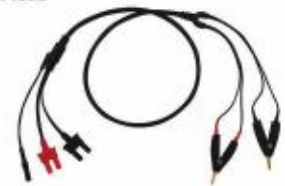
GTL-308 Test lead